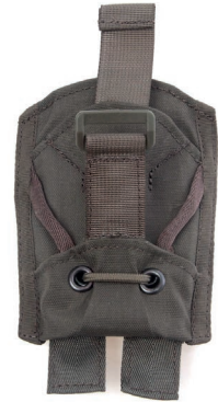
26-01254A Double Spoon garage 2.0

26-01254-01-000 Black 26-01254-09-000 Grey 26-01254-56-000 MultiCam