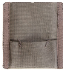
26-01254 Spoon garage -17

26-01870A01-000 Black 26-01870A09-000 Grey 26-01870A05-000 TAN499